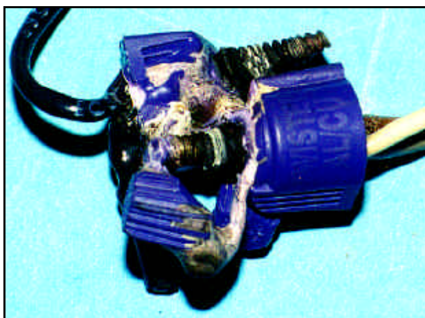
A. THESE TWO FAILED SPLICES ARE ADHERED TOGETHER BY THE MELTED PLASTIC SHELLS

Additionally, field burnouts have now been reported with the Ideal #65 connectors in their rated applications. With CPSC skeptical (and requesting that UL withdraw its listing), the manufacturer initially agreeing that the connector is not for the pigtailling retrofit application, independent tests clearly demonstrating poor performance, and field failures reported, the use of the Ideal #65 "Twister" connector for the pigtailling application is definitely not recommended. If the COPALUM repair is not available, use the AlumiConn connector (See Section 1C).