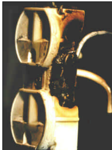
FIGURE 2 - EXAMPLE OF OVERHEATING OF ALUMINUM-WIRED TERMINALS ON A RECEPTACLE. Enough heat was generated by current flowing through the aluminum wire connections to cause charring of the receptacle body and disintegration of the insulation that was on the wire. Note that the face of the receptacle, as the homeowner or an inspector would have seen it, with the cover plate on, would look normal.