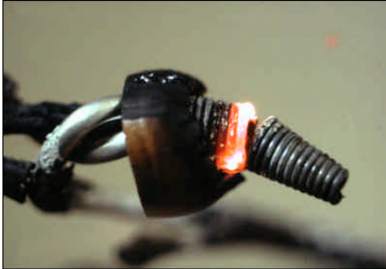
FIGURE 1 - ALUMINUM WIRE SPLICES MADE WITH TWIST-ON CONNECTORS CAN BE DANGEROUS. The use of most types of twist-on connectors with aluminum wire can lead to hazardous results. This twist-on pigtail connection (two #10 aluminum wires with one #12 copper wire, in a 20-amp circuit), made with a twist-on connector that was UL listed for use with aluminum wire at the time, remains electrically functional in the circuit, but it becomes extremely hot whenever a significant amount of current flows. The heat has deteriorated the insulation on both the connector and the wires. In this photo, a portion of the connector's spring is red hot, at current well below the circuit rating.