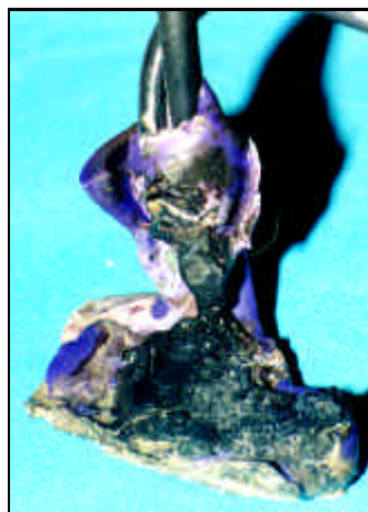
B. SEVERE FAILURE, PLASTIC SHELL MELTED AND CHARRED. THE CHARRING INDICATES THAT IT HAD PROBABLY IGNITED.