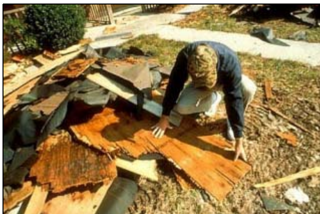
Figure 3. Failed FRT plywood roof sheathing after removal.