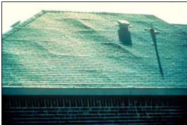
Figure 1. Outside view of failed FRT plywood roof sheathing.