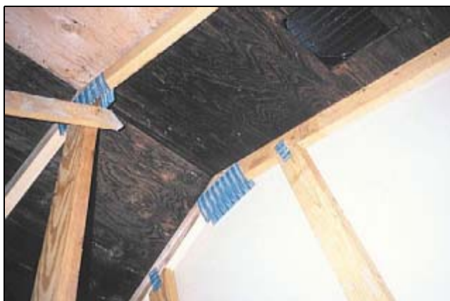
Figure 2. Inside view of failed FRT plywood roof sheathing.